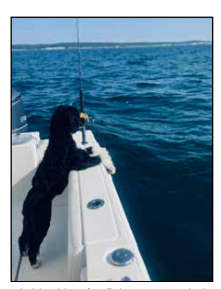
KiKi looking for fish near Martha's Vineyard