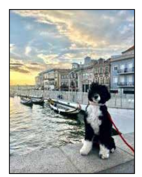
KiKi in Aveiro, Portugal