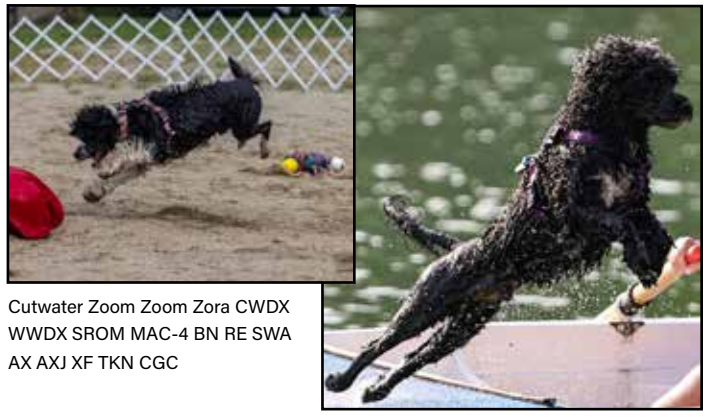
CH Cutwater Here There & Everywhere MWD4 WWDX GROM MAC-8 CD BN RX RAE MXB MJS MFB T2B SEE SWA TKA BCAT PKD-N CGC